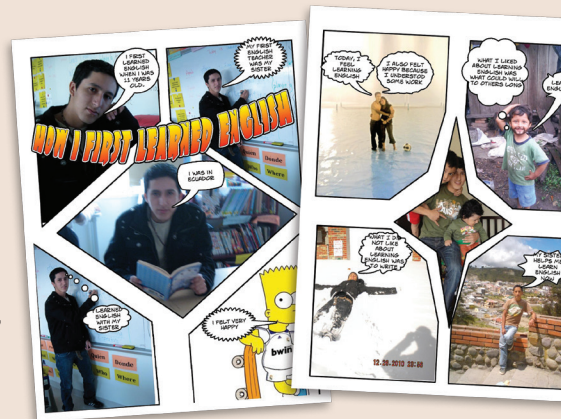
Wing had her students tell their immigrant stories using comic book software.